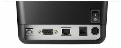
Multi I/O Interface Support (USB, Serial, Ethernet, RJ-11)